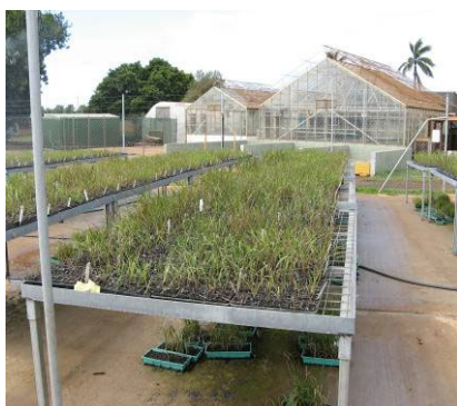
e) Sugarcane seedlings in growing trays