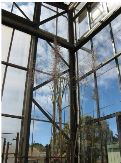
c) Fuzz developing for future seed harvest