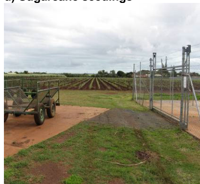
f) Sugarcane seedlings in a field trial

Figure 3. Photographic illustration of the steps involved in artificial crosses performed in Saccharum breeding programs. Photo taken by OGTR at BSES station (Aug 2007)