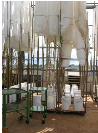
b) Cut male and female inflorescence bagged for crosses (2 weeks)