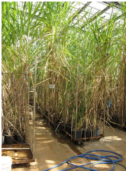
a) Sugarcane cultivars in the glasshouse ready for crossing

photoperiod so that flowers can be available for crossing when required (Bull & Glasziou 1979).