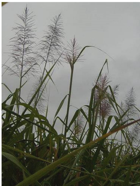
Figure 4. Saccharum spp. hybrid inflorescences.

The sugarcane inflorescence is an open branched panicle, also known as an arrow, whose shape, degree of branching and size are highly cultivar specific (Figure 4). The arrow can bear thousands of flowers (Sleper & Poehlman 2006), estimated to average 24,600 florets (Rao 1980). The arrow consists of a main axis and first, second and third order branches. Attached to the branches are spikelets arranged in pairs, one of which is sessile and one pedicellate, that bear individual flowers (Figure 5). At the base of each spikelet is a row of silky white hairs. Sugarcane flowers consist of three stamens (male) and a single carpel with a feathery stigma (female) typical of wind pollinated flowers. Frequently, the male stamens may be abortive resulting in reduced or absent pollen production (Moore 1987; James 2004; Sleper & Poehlman 2006). Anther colour varies from bright yellow to purple (Moore 1987).