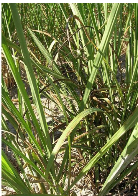
Figure 7. Smut on Saccharum spp. hybrid in Bundaberg (May 2010).

Pachymetra root rot caused by Pachymetra chaunorhiza , an Oomycete, is a disease only found in Australia in the QLD sugarcane districts (Magarey & Bull 2003). It was first identified as northern poor root syndrome in the 1970s, before the disease-causing organism was identified (Magarey 1994). The disease seems to favour high rainfall areas, and spores can survive up to five years in the soil. In northern QLD, surveys indicate that almost every field is infected with the pathogen. The disease is characterised by a soft rot of the primary and some secondary roots, leading to poor root development. Yield loss caused by Pachymetra root rot was estimated to be up to 40% in highly susceptible cultivars (Croft et al. 2000). Fungicides have not been effective at an economical rate and control is based on planting resistant cultivars (Magarey 1996).