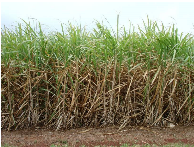
Figure 1. Sugarcane growing in Bundaberg, QLD. Photo taken by OGTR, August 2007.

It is believed that S. officinarum was brought to Australia in 1788 on the First Fleet but cultivation was not immediately successful (Bull & Glasziou 1979). The first official record of sugarcane in Australia was in Port Macquarie in 1821, and the first record of sugar manufacture was in 1823 (Buzacott 1965). The first Australian commercial sugar mill began operation in 1864. Sugarcane cultivation spread along the QLD-NSW coastline and a system of large central sugar mills, supplied with cane by independent farmers, was introduced by the Colonial Sugar Refining Company (now Sucragen) (Queensland Sugar Corporation 2002)(Figure 1).