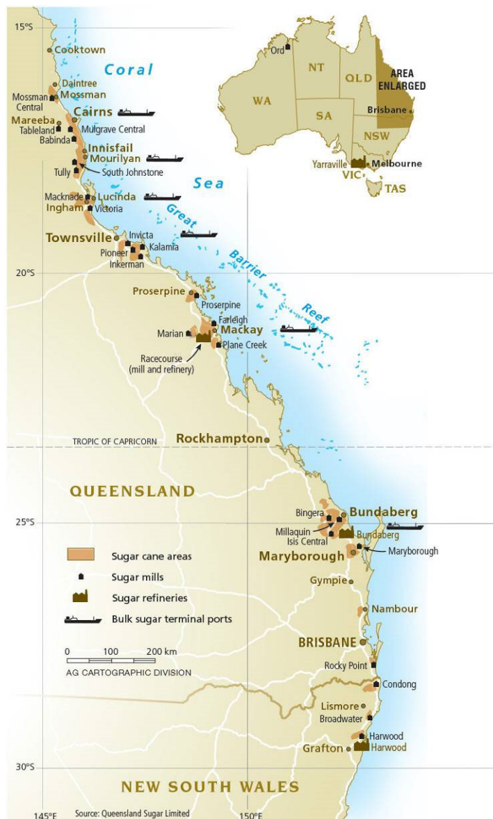
Figure 2. Map of sugarcane industry in Australia, October 2010.

The cultivation of sugarcane relies on the extensive use of fertilizers and pesticides. Nitrogen especially is widely used. Nitrogen is lost to surface runoff, groundwater, soil storage and the atmosphere (Freney et al. 1994; Weier et al. 1996; Bohl et al. 2000; Macdonald et al. 2009). In Australia, there is a declining nitrogen usage from an average of 206 kg N ha -1 for the 1997 crop to 164 kg N ha -1 for the 2008 crop (Wood et al. 2010). Phosphorus is usually applied at 22–80 kg ha -1 and potassium at 10–140 kg ha -1 (Bull & Glasziou 1979). Insecticides such as chlorpyrifos may be used to control insect pests, and herbicides, including atrazine, diuron, and paraquat can be used for weed control (Hargreaves et al. 1999). It is estimated that herbicides comprise 90% of the pesticides used on sugarcane farms (Christiansen 2000). These are used both within the crop and in other areas on the farm to reduce nesting areas and food sources for rats (Christiansen 2000). In addition, rodenticides such as coumatetralyl and zinc phosphide, and fungicides such as triadimifon and propiconazole, are used to control rodents and diseases (BSES Ltd 2006; Dyer 2010). Chemicals may also be used to help ripen the sugarcane, and increase the accumulation of sugar in the stalk. Etherel ((2-chloro-ethyl) phosphonic acid), a growth regulator, is registered for use in Australia, but is not widely used due to variable yield