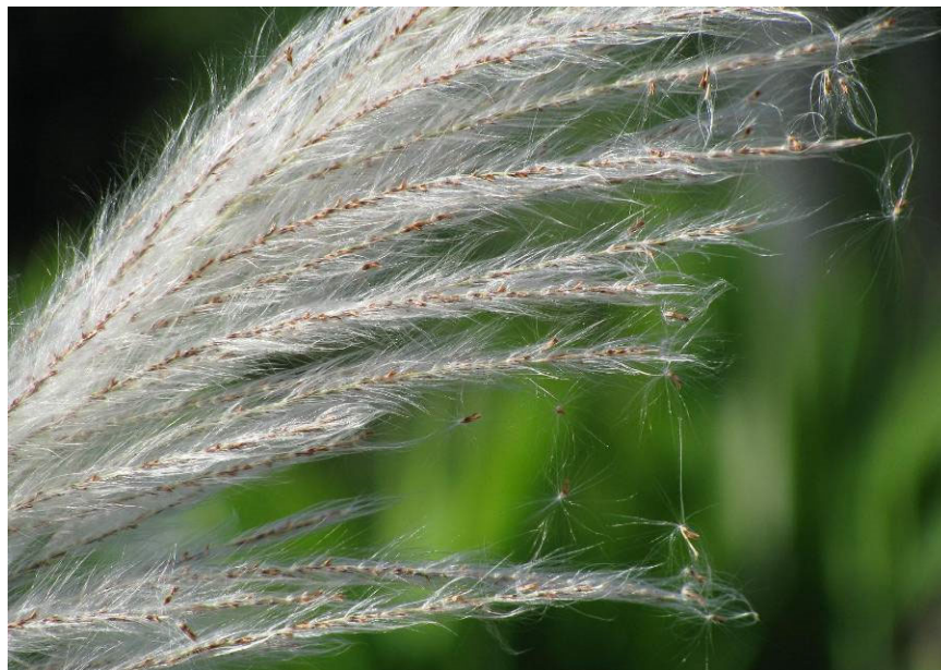
Figure 6. S. spontaneum seed.

Mature fuzz consists of the mature dry fruit (caryopsis), glumes, callus hairs, anthers and stigma (Breaux & Miller 1987). The additional parts of the inflorescence are generally handled, stored and sown with the seed because it is not practical to separate them. Although many commercial cultivars of sugarcane can produce seed, it is only used in breeding programs, because the proportion of sugarcane seedlings with agronomic qualities near to those of the parental commercial cultivars is extremely low.