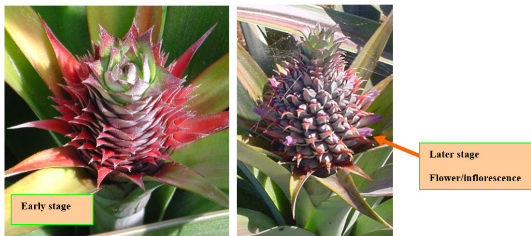
Figure 3.

Pineapple flowers do not abscise; the petals, stamens and style wither and the entire flower develops parthenocarpically into a berry-like fruitlet. The fruit of pineapple is a seedless syncarp and polygonal in shape. A syncarp is derived from the fusion of many individual flowers/fruitlets into one fruit. The fruit consists of the fused ovaries, bases of sepals and bracts, and cortex of the central core. In the mature fruit, the bract, sepal and ovary tissues are prominent (Medina & Garcia 2005). A 20-fold increase in weight occurs during the growth from flower to fruit.