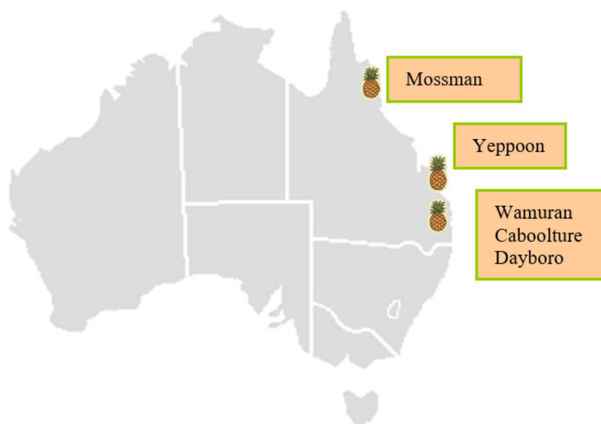
Figure 1. Map taken from Australian, States and Territories Map (2007) ( http://www.gov.au/sites/index.html ). Location of places on the map is only to give a broad idea of pineapple cultivation areas in Queensland.

Australia exported 1t canned fresh fruit to Hong Kong and East Timor during 2004/05 (Rohrbach et al. 2003; QDPI 2007). Pineapple production reached 139kilo t (kt) worth $44m in 1999/00, while in 2004/05 production decreased to 110kt (worth $37m) and 104kt respectively (DAFF 2007b). Table 2 indicates the pineapple yield in t/ha and the number of hectares under cultivation during 2001-05 in Queensland.