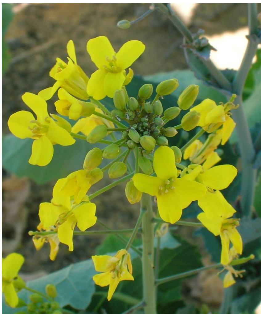
Figure 3. Flowering raceme of canola ( B. napus ).

and/or be insect pollinated (OECD 1997) and whose pollen can also become airborne and potentially travel at least several kilometres downwind (Treu & Emberlin 2000).